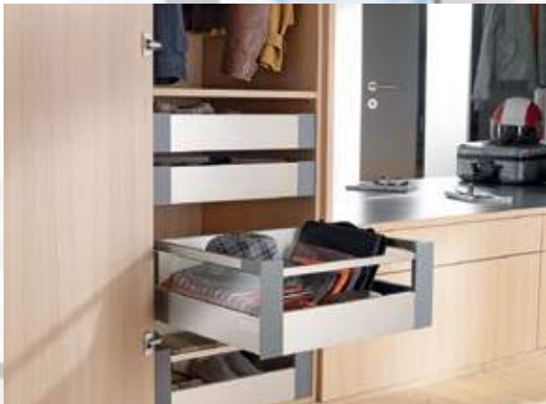
Having a SPACE TOWER in your hall allows you to store coats and accessories tidily. The picture above shows a solution with TANDEMBOX antaro in anti-fingerprint stainless steel.