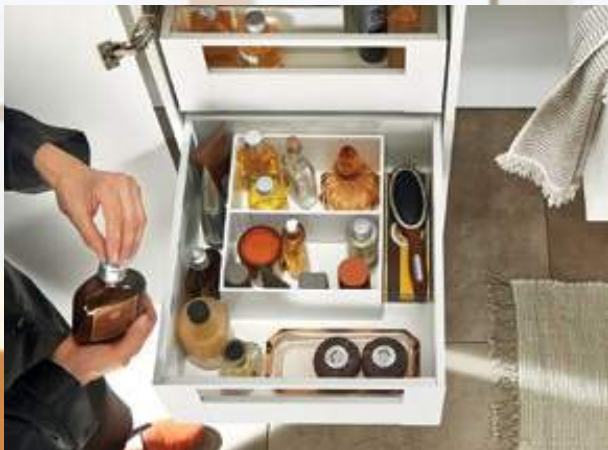
You can also organise cosmetics in your bathroom so they are always close at hand – this picture shows LEGRABOX pure in silk white matt.