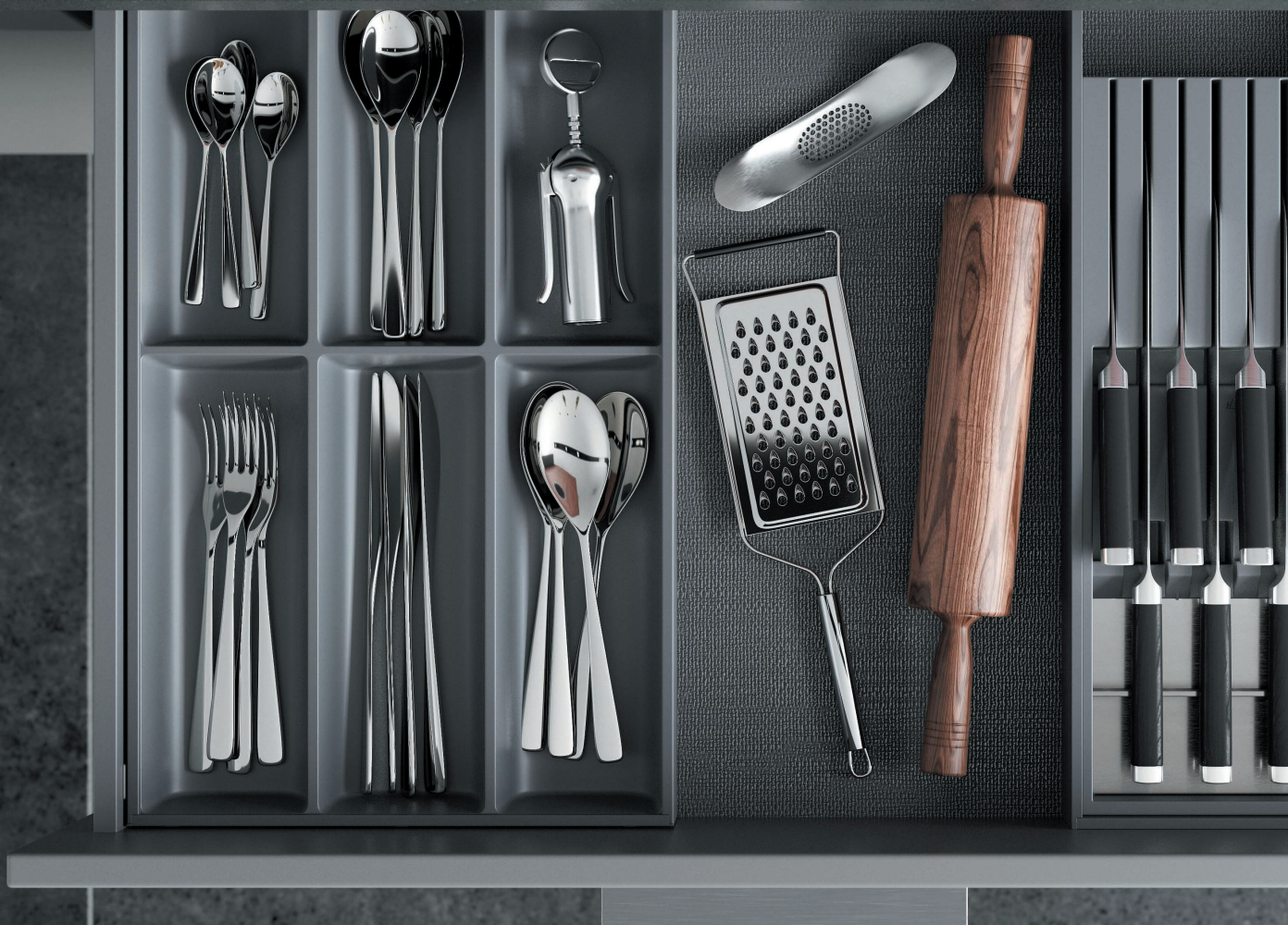
Grey Non-Slip Matting in partnership with Blum AMBIA-LINE