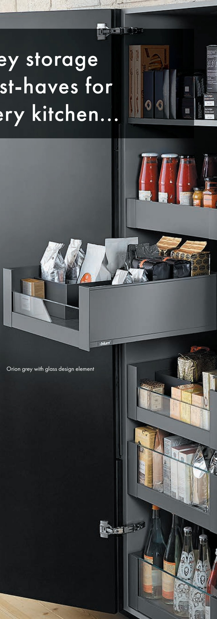
Orion grey with glass design element