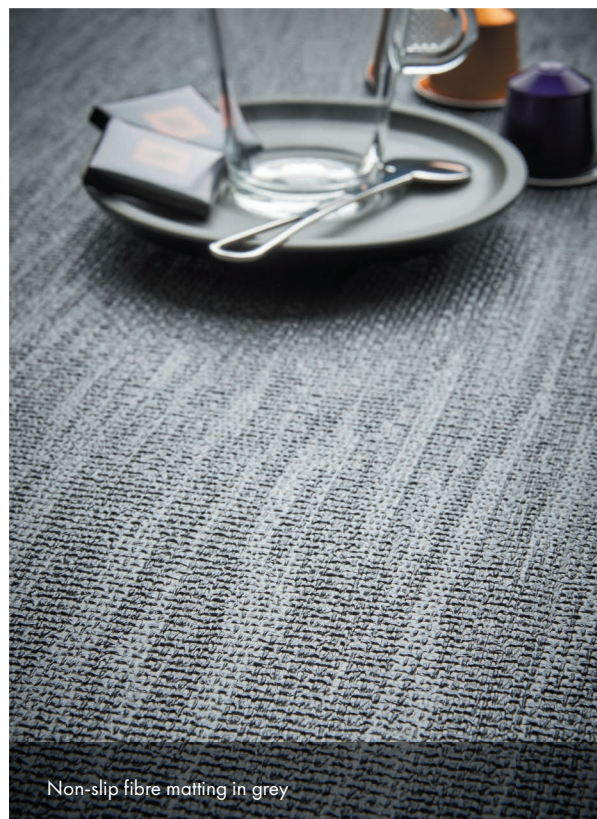
Non-slip fibre matting in grey

Made from natural and synthetic rubber, fibre matting has a unique texture which ensures that drawer dividers, cutlery inserts and general contents alike do not slide when the drawer is in use. The textile structure produces a very high anti-slip factor which is easily removed and wipe-able, and the drawer matting is pre-cut to size to suit any size Blum drawer. Grey non-slip fibre matting works perfectly within orion grey LEGRABOX drawers and AMBIA-LINE.