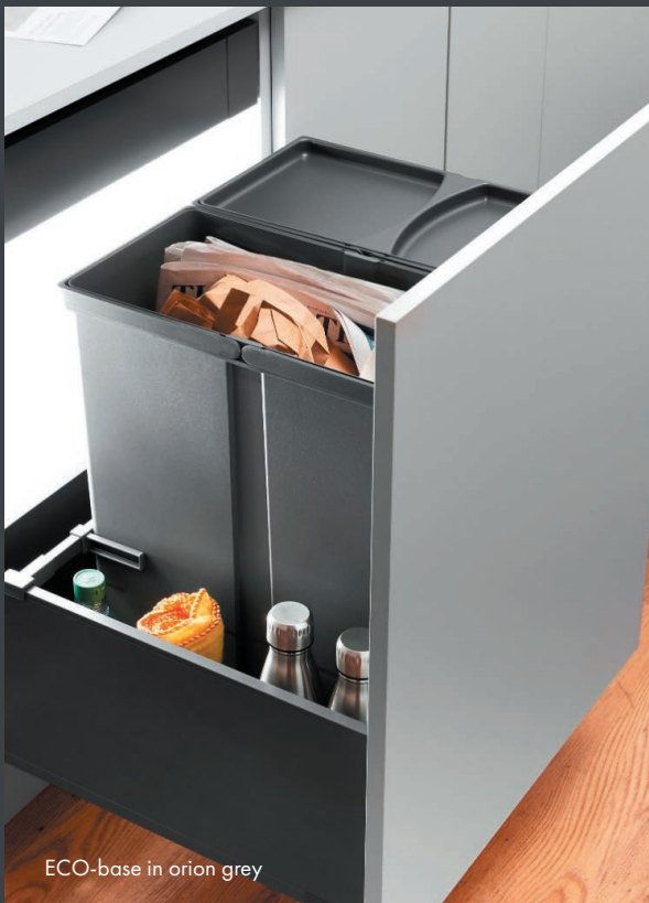
ECO-base in orion grey