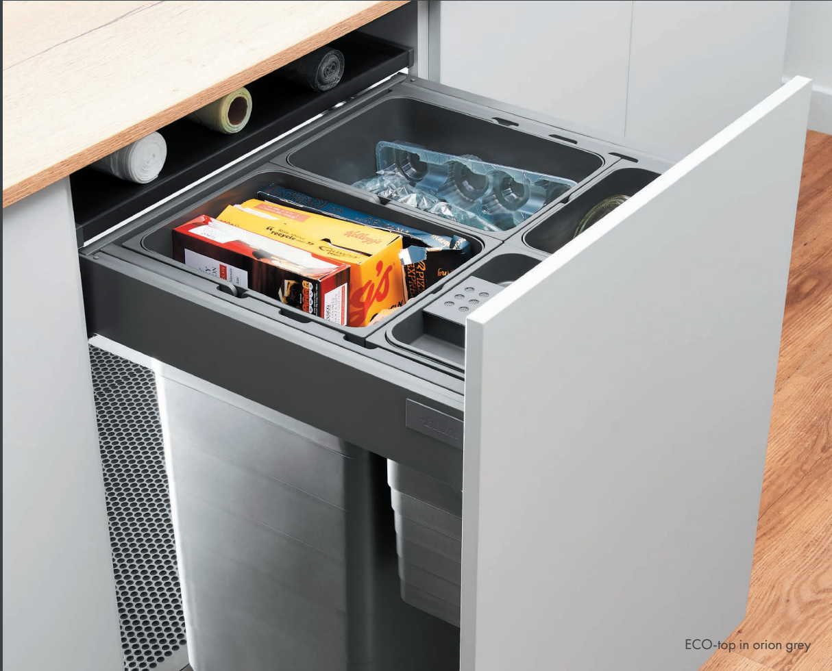
ECO-top in orion grey